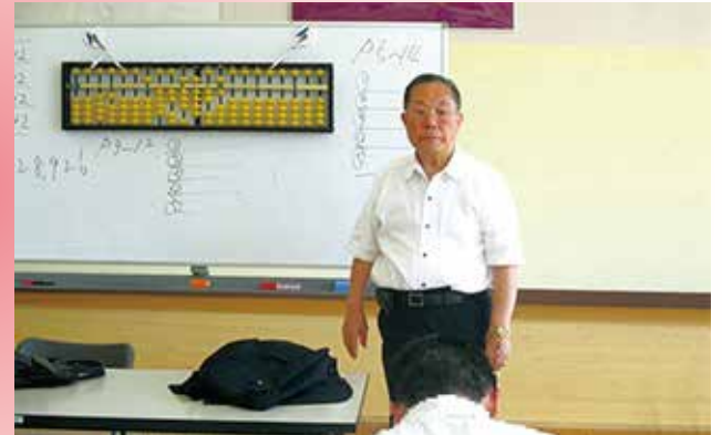
Abacus calculation class