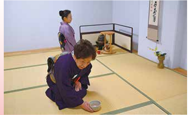
Club activity: Tea ceremony