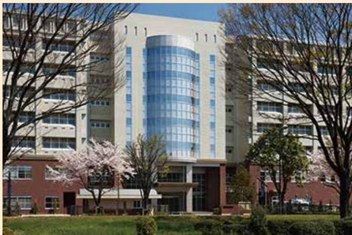
Tachikawa Detention House