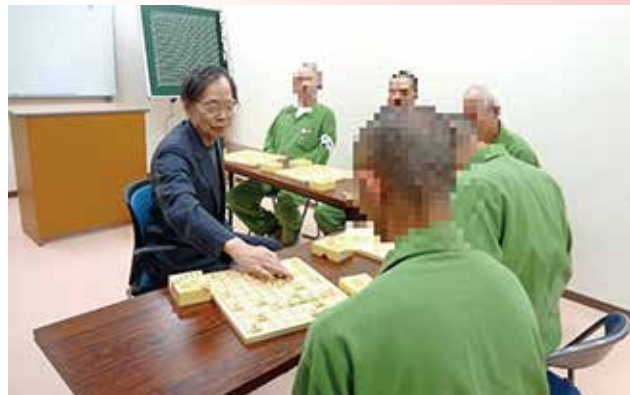
Club activity: Japanese chess