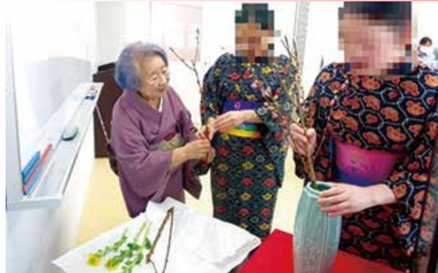
Club activity: Flower arrangement