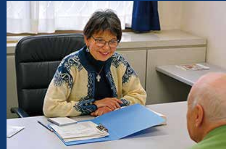
Counseling to a foreign prisoner

National Volunteer Prison Visitors' Association