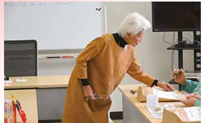
Club activity: Postcard art class